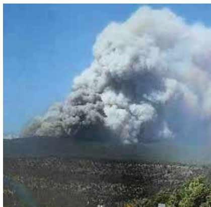
A FOREST FIRE, JUST THREE MILES FROM THE MONASTERY, DECIMATES OVER 6000 ACRES OF THE GILA NATIONAL FOREST.